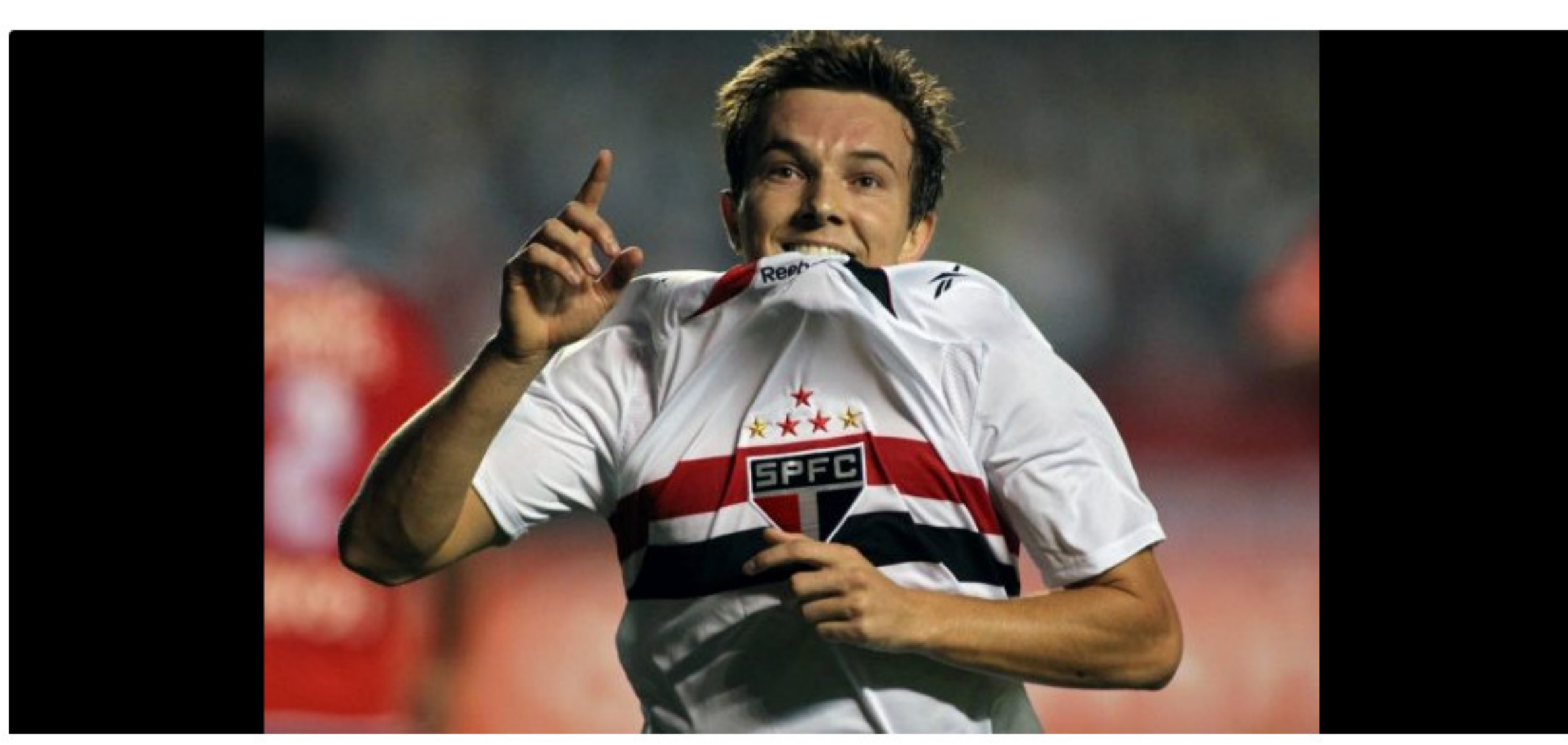
Sao Paulo's Dagoberto celebrates his goal against Paraguay's Nacional during their Copa Libertadores match in 2010.

The Brazilian midfielder/forward comes to San Francisco after one of the most successful domestic professional soccer careers in the Brazilian Série A.