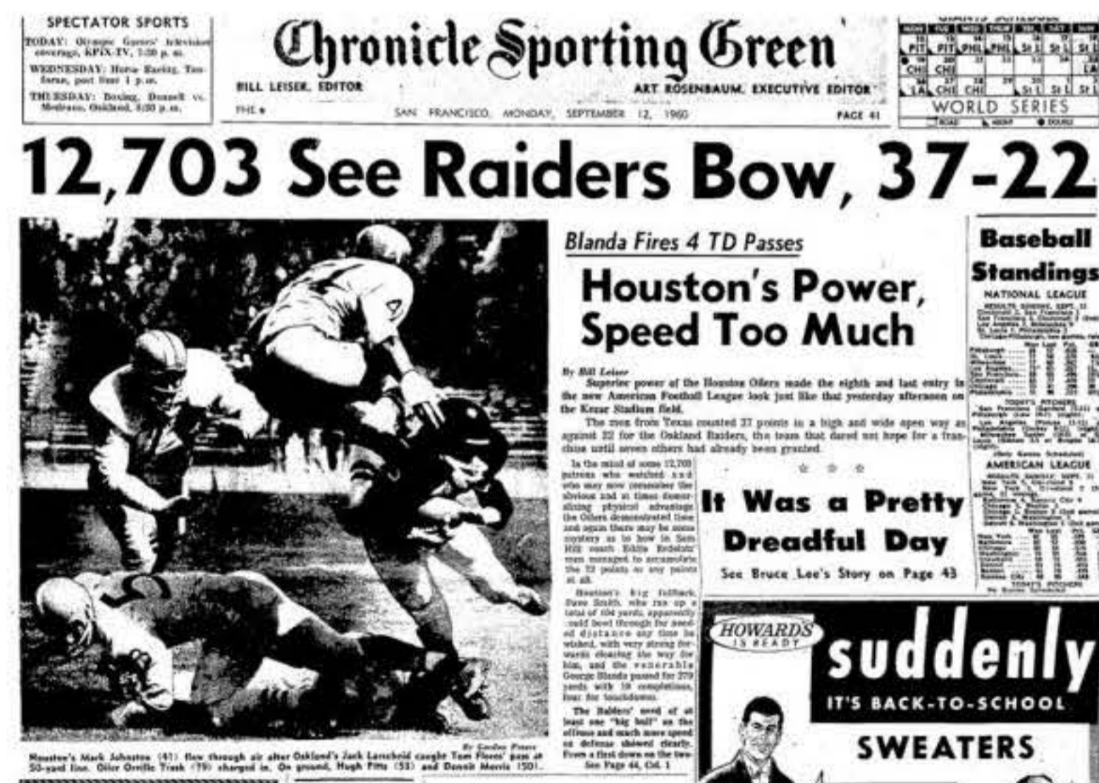
The Oakland Raiders played their first regular season game September 11, 1960 at Kezar Stadium in San Francisco.

The Raiders played the team's first four home games ever in 1960 at Kezar Stadium. They then played the remainder of the season and 1961 season at Candlestick Park in San Francisco before moving to Oakland's Frank Youell Field in Oakland in 1962. The Raiders called the brand new Oakland Coliseum home starting in 1966.